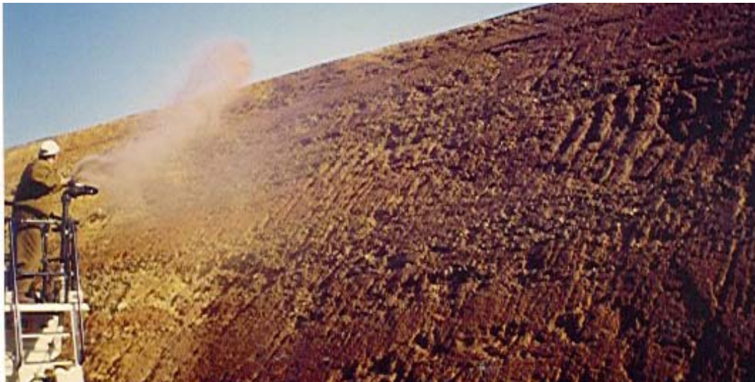
Figure 3: Treatment with hydroseeding and the use of Bitumen Cationic Emulsion (BAE) and Marble treatment waste (MTW)