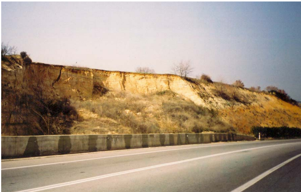
Figure 4: Final result after 2 years. In the left side of the picture we see the part which was detached while in the right side we see the part which remained unchanged

The result is because BCE and MTW have different electric charge and, due to this reaction, a stronger net was created keeping the seeds more steadily in the ground.