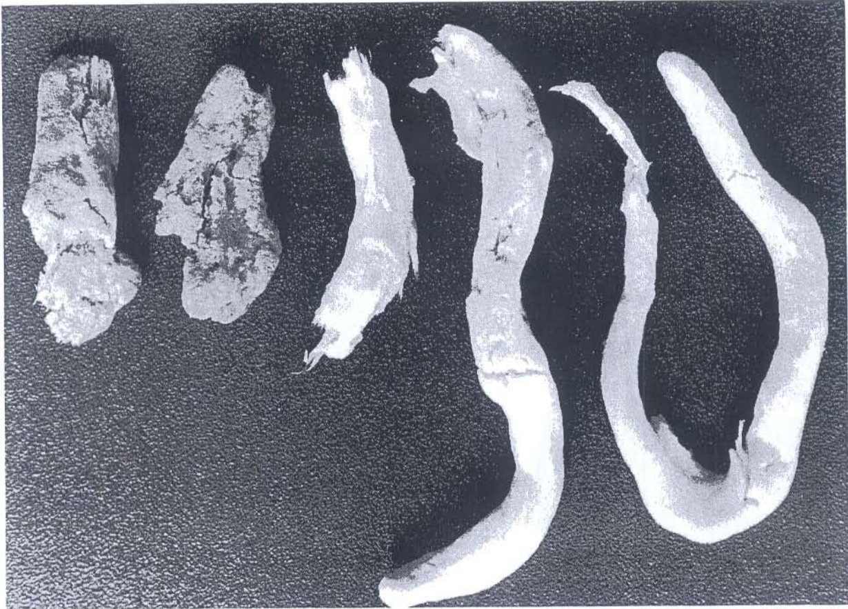
Fig.1. Suberites massa Nardo, long-branched fragments from the Aegean Sea (natural size).

to this species (cf. Topsent, 1900), from clavate with apical oscule, through thickly and thinly ramose, to massively encrusting-lobose. These growth forms are not readily recognizable in the original area from which the species was described (i.e. the British Isles), where only the clavate (sometimes doubly clavate) growth form is found (see Hiscock et al., 1984; Ackers et al., 1988). The clavate form (fo. typica sensu Topsent) is found throughout the Mediterranean and also occurs in the Aegean Sea. Thinly ramose growth forms (fo. ramosa sensu Topsent) have been recently reassigned to a separate species, Suberites syringella (Schmidt) (see below), while lobate forms (fo. flava sensu Topsent) are assignable to Suberites massa Nardo. Thinly encrusting growth forms (fo. incrustans sensu Topsent) are difficult to distinguish from Prosuberites epiphytum , and may be the initial stages of one of the mentioned species.