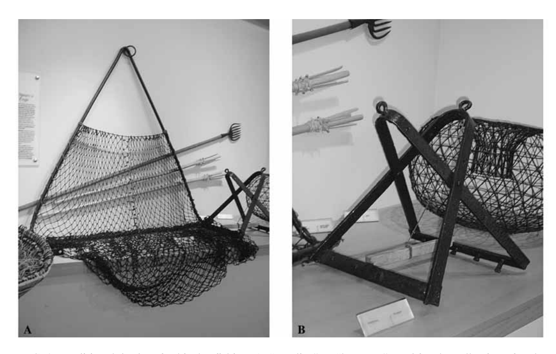
FIG. 2. Traditional dredges for bivalve fishing: A. "argalios" or "lagamna" used for the collection of scallops in the Gulf of Kalloni, island of Lesvos, North Aegean. B. "pinologio" used for the collection of fan mussels in the Greek Seas.

The Mediterranean population of P. nobilis (Fig. 1A) has been greatly reduced during the past few decades as a result of recreational and commercial fishing for food (fried or grilled), use of its shell for decorative purposes, and incidental killing by trawls, bottom nets, or anchoring. Until early in the 20<sup>th</sup> century, P. nobilis was also exploited for its byssus, from