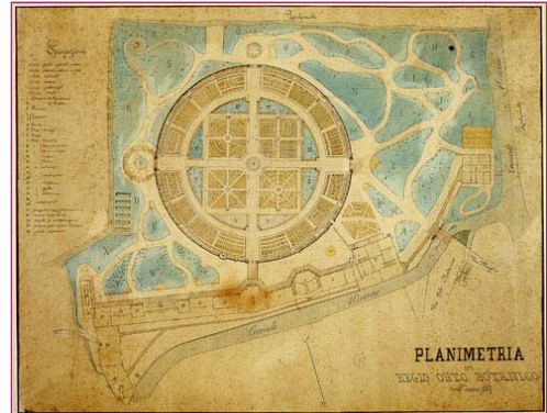
Plan of 1887 of the Botanic Garden ( www.unimo.it/ortobot/horti/cd/Padova/padovahome.htm )

As the origin of substratum deposits is alluvial, the ground is very permeable and the circulation of water is high. This seems to create problems of collapse in different parts of the city, as in the botanic garden, in case of subsurface constructions like parking.