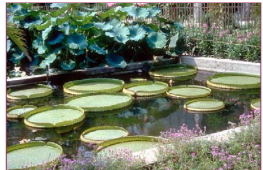
Water lily in the Botanic Garden ( www.unimo.it/ortobot/horti/cd/Padova/padovahome.htm )