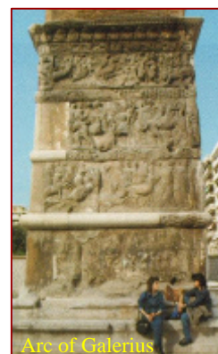
Arc of Galerius

Stabilization of the foundation and masonry of the churches especially after the earthquake of 1978. Confrontation of the settlements and other geotechnical causes Consolidation of stones and mortars Conservation of frescos (icons) and mosaics Other restoration activities on the roman, paleochristian and byzantine monuments - eg. Roman Agora (3rd c. AD), Roman Palace (3rd c. AD), Arc of Galerius (3rd c. AD), Rotonda (3rd c. AD), Achaeropeitos church (5th c. AD), St. Demetrios church (5th c. AD), St. Sophia church (7th c. AD), Virgin of Halkes church (11th c. AD), Transfiguration (Metamorphosis) of our Lord church (14th c. AD), White Tower (15th c. AD) etc. The mosques and the baths of the turkish period are also under restoration.