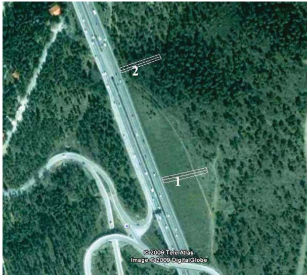
Fig. 1—Sites where the measurements of road noise were realised. Grass covered ground (1); forest (2).

407735 Extech Instrument, which has 2 measurement weighting networks, A and C. We used only the A-weighting. The instrument was placed at a height of 1.8 m above the ground as it is proposed by FHWA 9 and the microphone was orientated for perpendicular incidence. In both sites a straight line of measurement was made on the right side of the road to point 60 m away. The distance between the two measurement lines for the two sites was 150 m. Measurements were made at 7 locations every 10 m along this line, starting at the edge of the road at point 0. 10 At each microphone location seven 5-minute equivalent sound level measurements were taken. The measurements were taken downwind as referred to ISO 9613-2. The above procedure was repeated 35 times at both sites over a period of 2 months from 9.00 a.m. to 2.00 p.m. In total 245 measurements were taken in each site. The measurements along the two lines were taken concurrently.